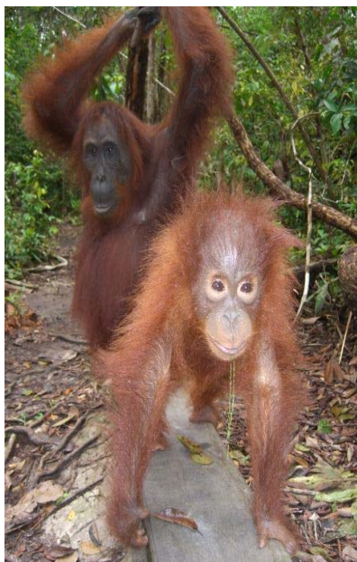
Juvenile Orang Utan, Pondok Tanggui Rehabilitation Centre, Kalimantan, Indonesia, Borneo