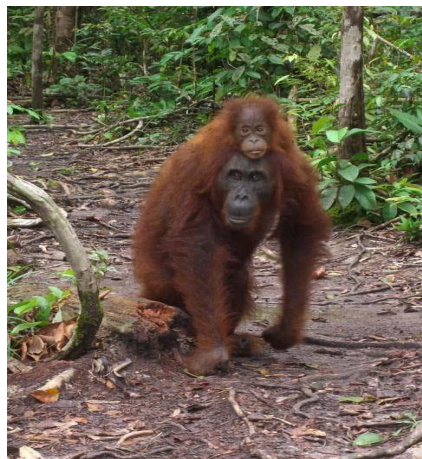
Orang Utan, Tanjung Puting National Park, Kalimantan, Indonesia, Borneo