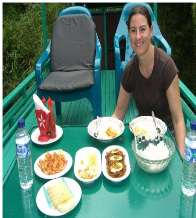
Lunch on the boathouse, Tanjung Puting National Park, Kalimantan, Indonesia, Borneo