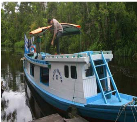
Boathouse, Tanjung Puting National Park, Kalimantan, Indonesia, Borneo