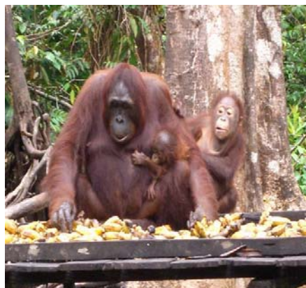
Feeding the Orang Utans, Tanjung Puting National Park, Kalimantan, Indonesia, Borneo