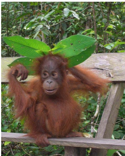
Baby Orang Utan, Tanjung Puting National Park, Kalimantan, Indonesia, Borneo