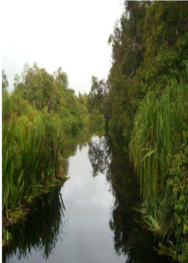
Black Water, Tanjung Puting National Park, Kalimantan, Indonesia, Borneo