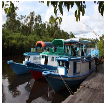
Boathouse, Tanjung Puting National Park, Kalimantan, Indonesia, Borneo